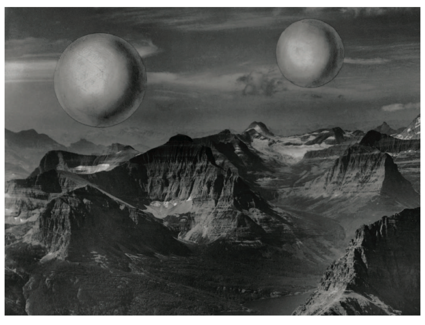
Figure 3: Buckminster Fuller and Shoji Sadao, Project for Floating Cloud Structures (Cloud Nine), ca. 1960.

Closing remarks with Leonardo Zuccaro Marchi | PoliMI and Raffaele Pernice | UNSW Sydney.